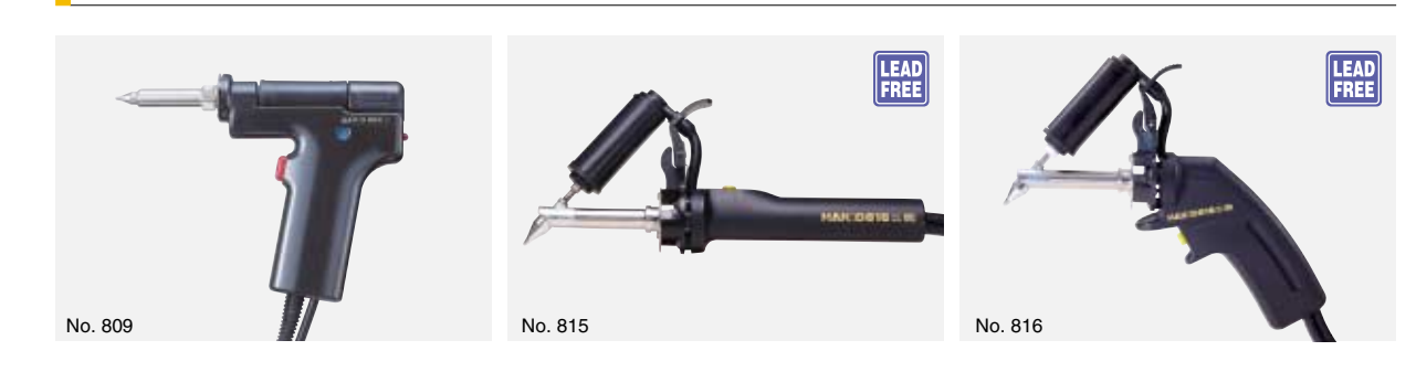
Desoldering Tools for HAKKO 474.475